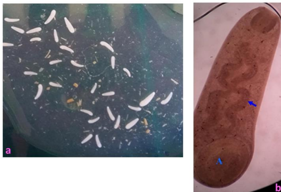
Fig. 1. Paramphistomum spp. (Early migrating juvenile flukes): a) fresh specimens, b) stained whole-mount showing a simple intestinal ceca (arrow), no reproductive organ and acetabulum (A) (Scale bar =2mm)

68.1% in female and 46.9% in male. In contrast, Birhanu et al., (2014) found that male camels (64.7%) were found to be harboring by the parasite more than the female camels (55.04%). This could be due to physiological peculiarities of the female camels, which usually constitute stress factors thus reducing their immunity to infections (Wakelin, 1984).