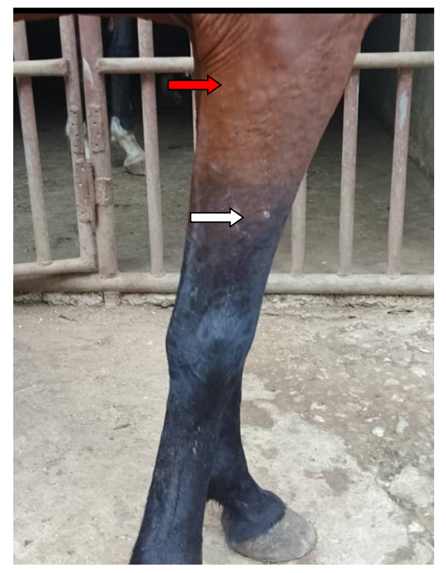
Fig. 5: Out come after treatment showing resided abscess swelling (red arrow) and complete healing (white arrow).

The patient recovered; the abscess swelling subsided with complete healing (Fig. 5).