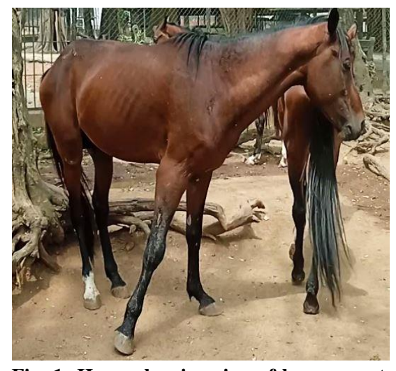
Fig. 1: Horse showing sign of lameness at presentation