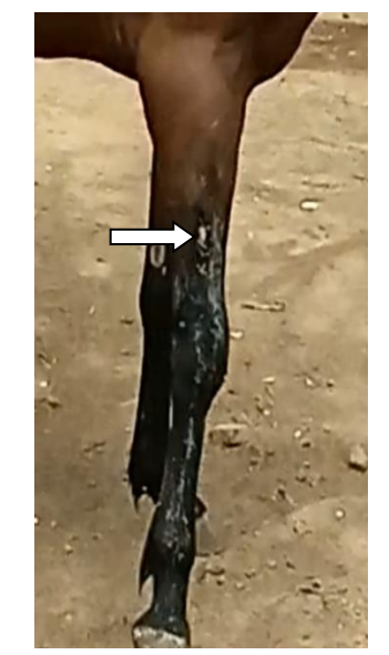
showing pus discharge