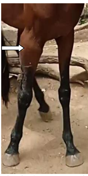
Fig. 2: Abscess swelling Fig. 3: White arrow on the right forelimb (white arrow)