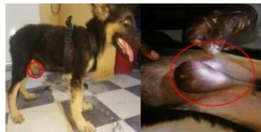
Figure 1: Showing the congenital malformation of the prepuce which appeared as a fluid-filled pouch with a pin-point opening both in standing and dorsal recumbency.

absence of ectoparasite, and a congenital malformation of the preputial orifice. The preputial sheath appeared as a fluid-filled