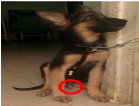
Figure 4: Showing the dog after suture removal at 14 days post-surgery.

material using a simple interrupted suture pattern. The surgery was completed within an hour. Amoxicillin at 25mg/ml twice daily per os for 5 days. Tramadol (Ultram® 50mg tablet, Jansen pharms, Belgium) was dispensed at a dosage of 3mg/kg body weight 12 hourly for one-week post-surgery. An Elizabethan collar was fixed to prevent licking and self-mutilation. Daily monitoring revealed normal physiological parameters. The dog was represented after 14 days following healing for suture removal