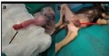
Figure 3: Showing penis (A- black arrow) and preputial orifice (B- red arrow) after surgical correction of the anomalies.

The penis was carefully separated at the penile frenulum (Figure 3). The skin was sutured to the underlying mucosa with size 2-0 nylon suture